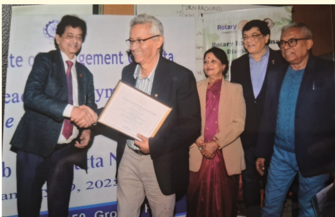
1st Club President Training Seminar