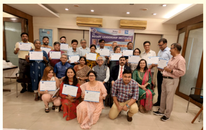
RLI Part II, on 7th September'25 our Club President and Secretary attended there