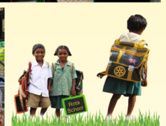
On the occasion of Teacher's Day we felicitated 4 Teachers of our Rota School on 5th September'25.