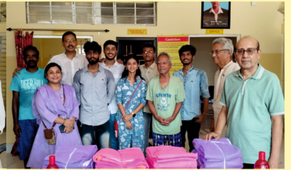
Mosquito Nets distributed amongst the inmates of S. C. Sen Old Age Home (Natun Ghar), Muragacha, Sodepur on 15th August'25